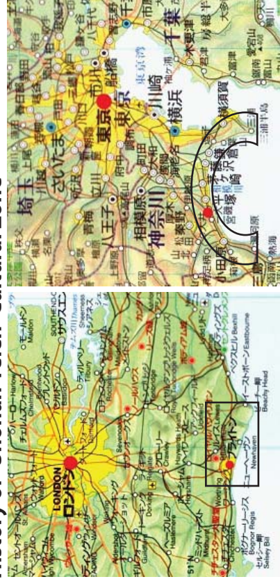
figure 1. Brighton, UK and Shonan Area (same scale)

Shonan Area, the southern part of Kanagawa Pref, were characterized as villa and health resort area for political, financial or cultural leaders in Japan who work in Tokyo since Meiji Period. That is very similar to the relation between London and Brighton, UK.